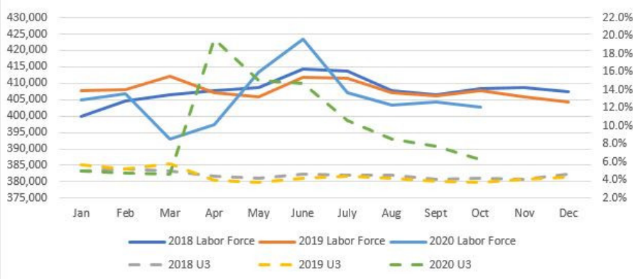
Unemployment Rate 2019-2020 Indiana vs. NWI